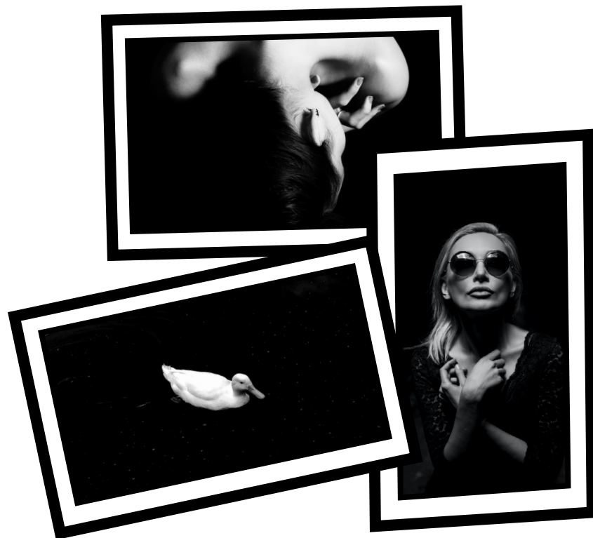
Examples of images with black backgrounds

However, you don't have to be limited to shooting indoors. Search for cool black backgrounds outdoors. With the proper attention, it's possible to find the dark nature background and capture dramatic outdoor portraits.